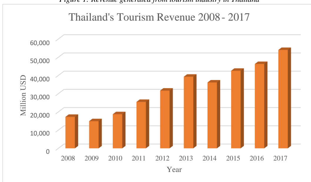
Figure 1: Revenue generated from tourism industry in Thailand